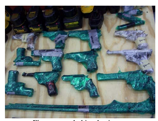
Firearms sealed in plastic.

Controlled with Standard Dissemination - This information requires standard safeguarding measures that reduce the risks of unauthorized or inadvertent disclosure. Dissemination is permitted to the extent that it is reasonably believed that it would further the execution of a lawful or official purpose.